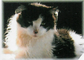
Opie, our oldest (19 yrs.)