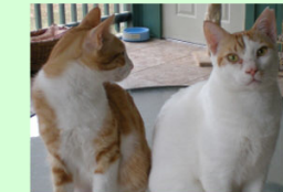
More Hoarder cats: LuvBug & O. J. two brothers above and Oreo below still waiting for their purrfect home.