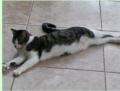
Handsome had badly infected eyes & hair loss from lice when rescued. 6 months later, he grew into his name.