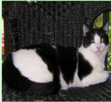
Magic had ulcerated eyes and was covered in filth when rescued. Look at this big, healthy boy 6 months later.