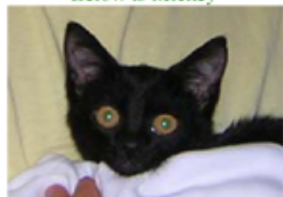
Honey has waited a VERY long time for her special purrson