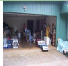
LINED UP FOR SURGERY AT THE SANCTUARY

seen, so we took her in, fostered her and found her a great home. Her new best buddy is a DOG!!