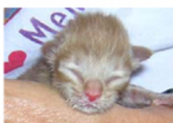
Below is Honey.