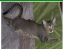
Above Turk. Below Tula