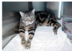
Below is Mickey