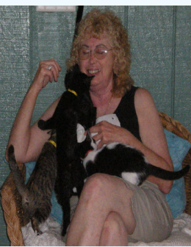
COME VISIT US AT 9th LIFE HAWAII'S SANCTUARY