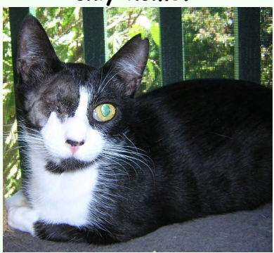
CALL 573-3365 IF INTERESTED IN ADOPTING