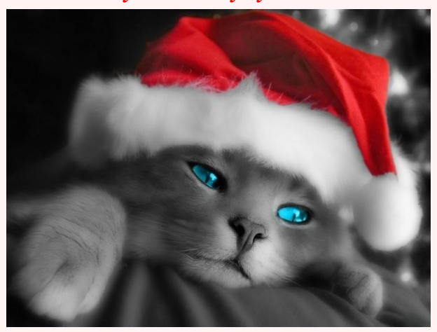
OUR WISH FOR YOU! A JOYOUS HOLIDAY PEACE ON EARTH AND HAU'OLI MAKAHIKI HOU