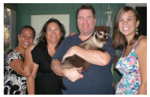
Ari being adopted by his forever family.