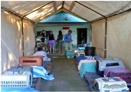
Lined up for Surgery