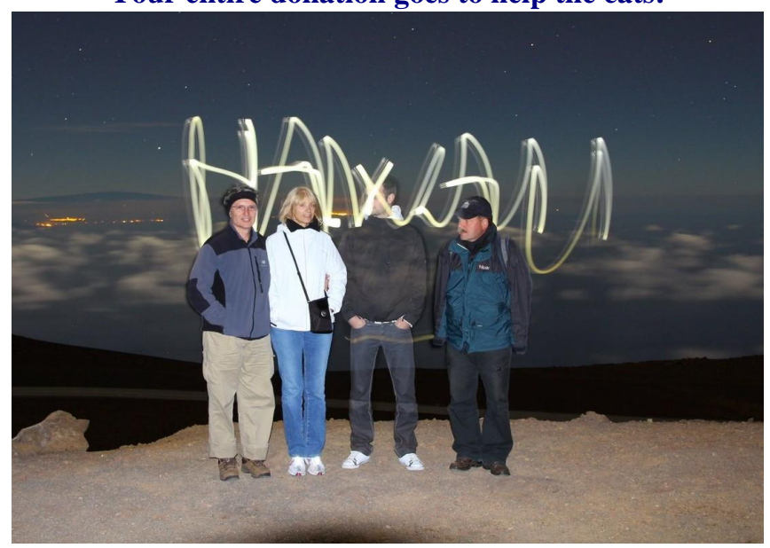
Vets and staff at Haleakala Summit at night (above). Below the vets at work.

A non-profit 501C3 Organization - Donations are tax deductible Run Solely by Volunteers Your entire donation goes to help the cats!